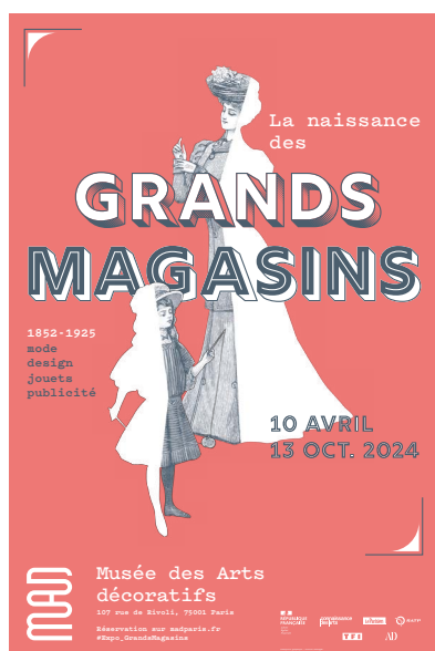
Graphic identity of the exhibition “La naissance des grands magasins” — © Atelier pentagone