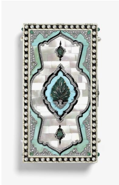
Necessary — Cartier Paris 1924