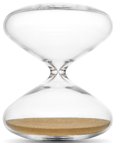
The Hourglass — Marc Newson 2015 Switzerland Borosilicate glass, gold-plated stainless steel nanoballs