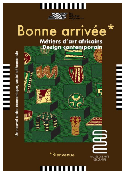
Poster of the exhibition