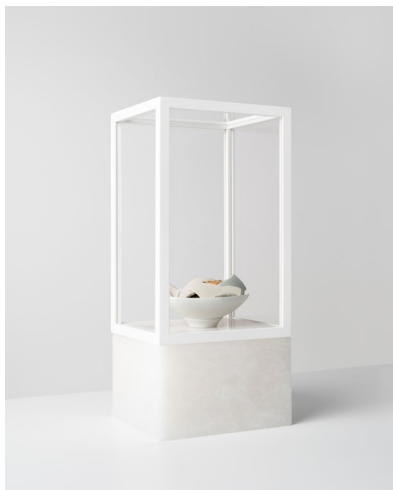
Edmund de Waal — Letters to Camondo, II 2021 Alabaster, gilded lead, porcelain, aluminum and plexiglas © Edmund de Waal. Courtesy the artist. Photo: Alzbeta Jaresova