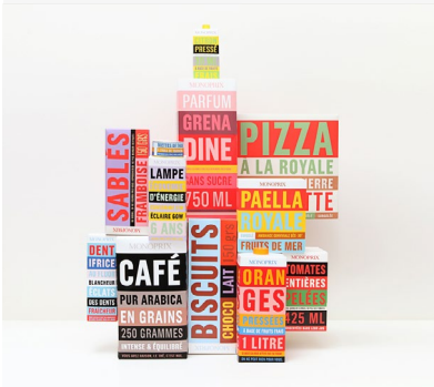
Jacques Tissinier — Table, stool and bench 1973 © MAD, Paris / Jean Tholance, Cléo Charuet / Cleoburo — Monoprix packaging 2009 © Cléo Charuet / Cleoburo