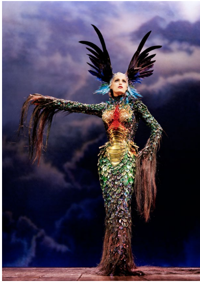
La Chimère Collection — Haute couture Fall-Winter 1997-1998