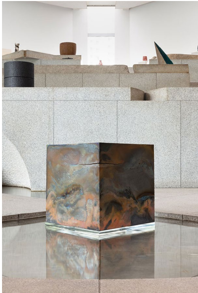
The Loewe Foundation Craft Prize show at Sogetsu Kaikan, Tokyo