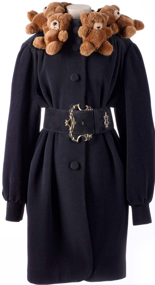
7. Moschino — Black Teddy Bear Coat and Belt Fall-Winter Collection 1988-1989 1988 Wool; metal; teddy bear plush