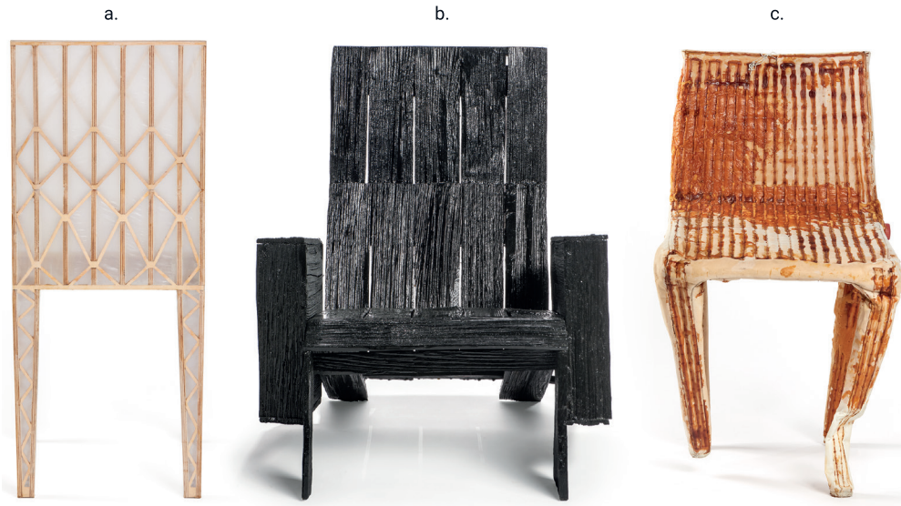
a. Chaise Very Nice , 2003 creation, 2022 refabrication. Plywood and silk pongee © Les Arts Décoratifs / Photo: Charlaïne Croguennec / Hom project b. Fauteuil en bois fendu, 2015. Split chestnut, wood soot, amber varnish. Paris, musée des Arts décoratifs © Les Arts Décoratifs / Photo: Jean Tholance c. Chaise Pack « loupée », 1999. Polyester fabric, polyurethane foam © Les Arts Décoratifs / Photo: Charlaïne Croguennec / Hom project d. Vase Douglas 153, 2020. CIAV edition. Blown and molded glass.

To leave nothing but light traces, through a clear and simple aesthetic, this has been François Azambourg's journey from the beginning. This exhibition was conceived and designed in accordance with the designer's research on lightness. The production process of such an event was taken into account in order to reduce its impact on the environment. In consultation with the curators, François Azambourg sought to create a scenography with the least possible impact on the environment.