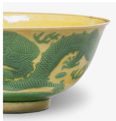
Bol — Chine, dynastie Qing (1644-1912), marque et période Kangxi (1662-1722) Porcelaine à décor gravé, émaux polychromes sur biscuit, bleu de cobalt sous couverte

As an archetypal form of tableware in Asia, the bowl serves multiple purposes and is associated with specific practices. Used for tea, the consumption of food and drink, the presentation of objects, and for aesthetic purposes, bowls small and large, ancient and contemporary, will be displayed throughout the museum. This will include a variety of materials, including stoneware, porcelain, agate, metal, lacquered wood, cloisonné, and painted enamel, as well as prints and photographs from the archives of the Musée des Arts Décoratifs that illustrate the use of bowls in Asian culture. Additionally, a traditional tokonoma , or teahouse niche, by Yamacho House of Kyoto, will be displayed.