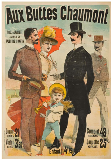
Jules Jean Chéret — Aux Buttes Chaumont 1888 Lithographie couleur