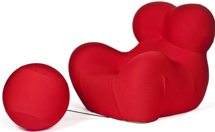
8. Gaetano Pesce — La Mamma 1969 © Les Arts Décoratifs